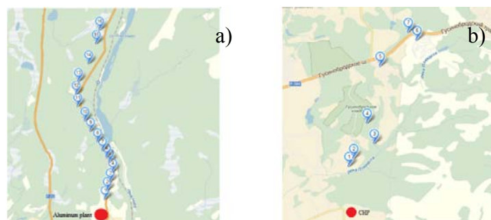
Figure 1. Map of sampling in the zone of influence of the enterprises: a) Aluminum plant; б) CHP

In this paper, for the study of mosses was sampled Pylaisia polyantha (Hedw.) and Sanionia uncinata , which corresponded to the length of the growth period of the three-year exposure. Samples of mosses Pylaisia polyantha was selected in a northeasterly direction at a distance of 1-5 km from the power plants and the moss Sanionia uncinata - at distances of 1-7 km kilometers to the north of the aluminum plant (Figure 1).