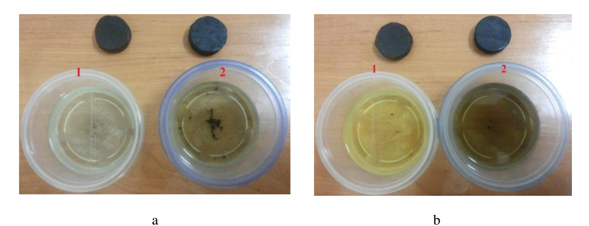
Figure 3. View of sample and types of drilling mud: a - diesel fuel, b - biodegradable drilling mud, 1 - t = 20^{\circ} C; 2 - t = 50^{\circ} C.

During the experiment (to 50 hours) intensive splitting of samples was observed to be plunged into biodegradable drilling mud and diesel fuel at temperature 50^{\circ} C (figure 3). As can be observed in the photos, the mud became dark and at the end of the experiment the detached pieces of samples could be found in it. It also confirms the high intensity of elastomer wear in hydrocarbon drilling mud even if the experiment is static.