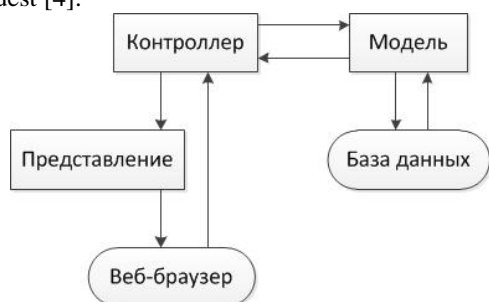
Fig. 1. The layout view of MVC structure

3. Controller. The controller on Rails is a set of logic launched after the server receives an HTTP-request [4].