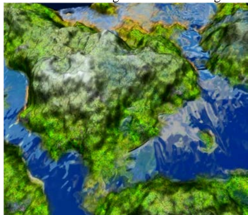
Figure 4. Final result of rendering

The result of rendering can be seen in Figure 4.