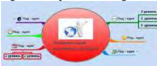
Fig. 1. Principles of creating a mental map

Thus, the mental map should have an associative structure. Currently, there are many software applications to create mental maps (paid and free) with different sets of functions that allow creation one's own style when drawing intellect-maps in the digital world: iMindMap, FreeMind, The Personal Brain, XMind, Free Mind Map [3. P.93-117].