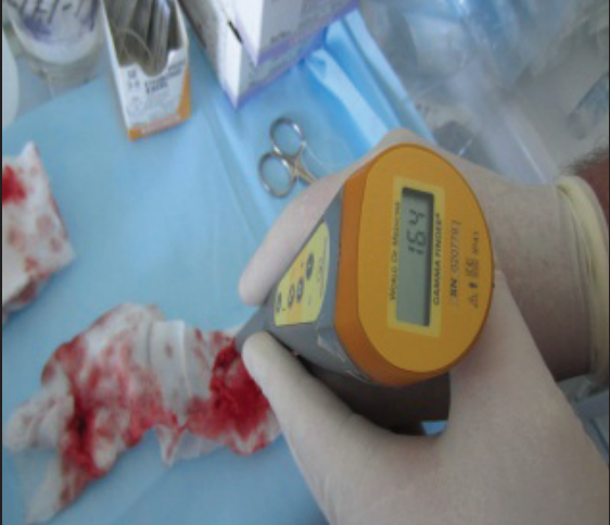
FIGURE 3. Direct radiometry macropreparations