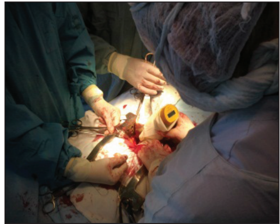
FIGURE 2. Intraoperative gamma probe-guided SLN identification in the area of the iliac-pelvic lymphadenectomy using Gamma Finder II® probe

For intraoperative detection of sentinel lymph nodes, the hand-held gamma-probe Gamma Finder II® was used, which allowed the surgeon to precisely locate gamma radiation source and obtain accurate information about the distribution of the radionuclide in tissues and organs of the patient. The intraoperative gamma probe-guided of SLNs was performed by the surgeon after the opening of the retroperitoneal space (Fig. 2). The registered gamma radiation level was displayed in numerical values.