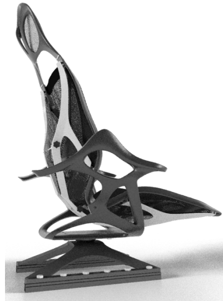
Fig. 6 Multipurpose seat

Conclusion. The designed multipurpose seat is the result of the conducted research (fig. 6, 7). The innovative design of the case for sitting, as well as the use of special materials provide the small weight and high durability of the design. Using carbon fiber and metalplastic material gives the chance to recycle and reuse it for a new product.