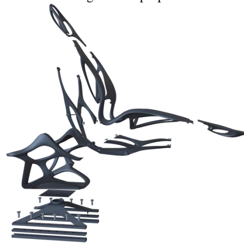
Fig. 7 Multipurpose seat (explosion scheme)