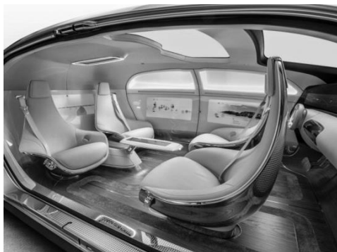
Fig. 2 Conceptual solution of interior from Mercedes-Benz producers

The BMW company has submitted the concept of the Gina car in which the form, both the case, and home decoration can change. In a framework of the car there is a system of actuated parts which work due to the hydraulic mini-installations, steered by the on-board computer, providing transformation of the case and home decoration. The framework will be completed with Spandex fabric.