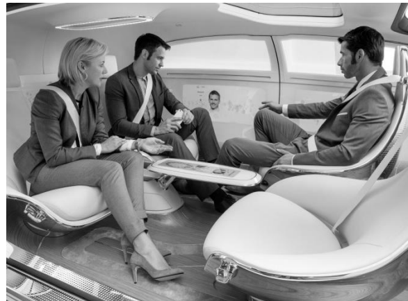
Fig. 3 Conceptual solution of interior from Mercedes-Benz F15 producers

Mercedes - Benz F15 has presented a striking example of functionality of Luxury class which is designed to provide a comfortable trip. The disadvantage of this conceptual decision is a lack of the possibility to reset a seatback depending on anthropometrical properties of the passenger. The advantage is the possibility of rotation around a vertical shaft creating the small hall of negotiations during driving. Much attention is paid to the creation of an adaptive interior and multipurpose use. The concept of Mercedes-Benz F15 represents a striking example of expanding functionality of a working zone (fig. 3).