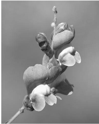
Fig. 4 Snapdragon bionic form

Proceeding from safety requirements, the seat will not have acute angles. In order to determine the form the structures of different bionic shapes were studied [3]. From bionic forms, the snapdragon flower was chosen. When opened, it reminds a seat and a back with plastic forms (fig. 4).