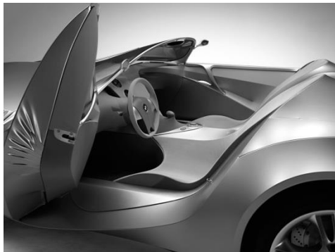
Fig. 1 Conceptual solution of interior from BMW producers

The concepts of interiors of BMW and Mercedes producers - Benz are studied, because now these companies are the most popular among car manufacturers. The comparative analysis of materials, production technologies, functionality, ergonomic properties is carried out (fig.1, 2) [1,2].