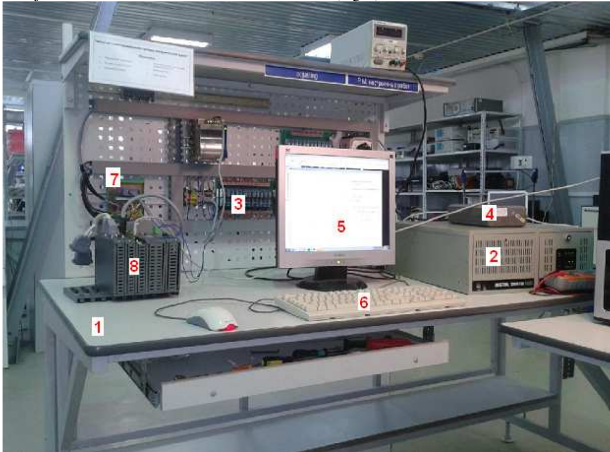
Figure 2. The test bed of the ELSY-TMK controller: 1 - a table of the tester, 2 - an industrial computer, 3 - a system of signal switching, 4 - a unit for specifying the external voltage (SA100calibrator), 5 - a monitor, 6 - a keyboard, 7 - a special demountable connector of the switching system, 8 - an ELSY-TMK controller with extension modules as an object-to-be-tested.

For automation purposes, the connection and control of an industrial computer were established with the object-to-be-tested and the calibrator on the test bed (Fig. 2).