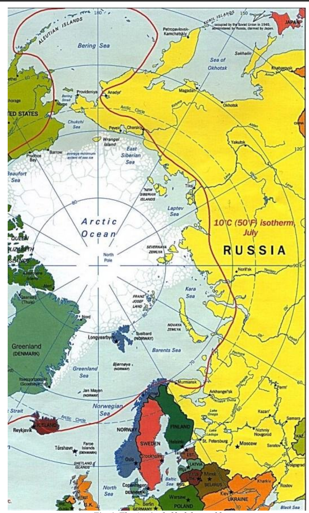
Fig. 1. The Arctic shelf of the world

The opinion of experts is that the present century is going to become «a century of the Arctic Region». In the long-term prospect, a number of factors will have their effect on