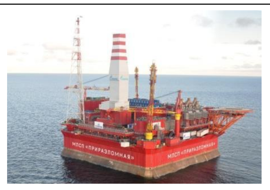
Fig. 3. The stationary ice-strengthened sea platform «Prirazlomnaya» in the Pechora Sea, Russia

However it would be difficult for Russia alone to cope with the task of the scale exceeding that of space-exploration programmes. Russia is ready for cooperation and collaboration with any countries and oil-and-gas companies on the friendly mutually beneficial basis. It may be a large international special-purpose oil-and-gas corporation.