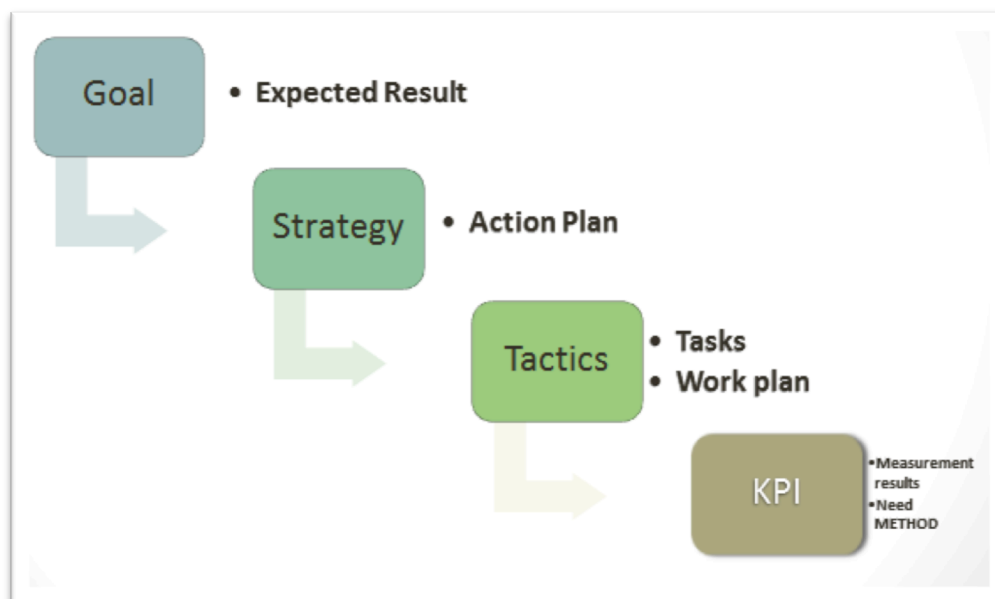
Fig. 1. KPI place in business process system

KPI's are a good alternative, reforming the business management system as a whole. KPI binding to the target wage level allows employees to express goals of the owner in a simple and understandable way - in salary (Srimannarayana, 2010). Enterprise Management System involves a chain of "goal-strategy-tactics-business processes." Levels can be both formal (typical for a company with a high level of internal organization), and formalized (Gabcanova, 2012). First, let us define the purpose of the enterprise. For example, the goal is to retain current position in the market. Then depending on the goals, the main directions of the goal (its strategy) are being outlined. According to the planned direction, a work plan is being developed - a tactical level of management. Further, at the operational level, the work plan is adopted by members of staff to their work (Fig. 1).