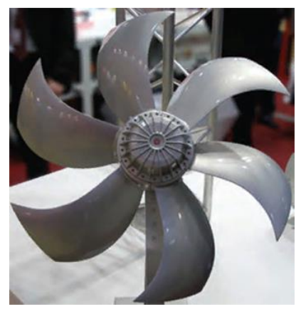
Fig. 1 Fan wheel with curved blades

The formation of vortices in the flow of the operating medium is inextricably linked with the frontal aerodynamic resistance of the body. To reduce frontal resistance, fan blades are made curved (Fig. 1). The frequency of the vortex noise is determined by the frequency of the breakdown of the vortices, which in turn depends on the lateral size of the body and the pressure at its front edge. Modern modeling technologies allow to clearly illustrate the distribution of the pressure gradient throughout the body of the fan blade. It enables to optimize the shape of the blade, reduce turbulence and vortex noise, smooth the pressure gradient (Fig. 2) [1, 3].