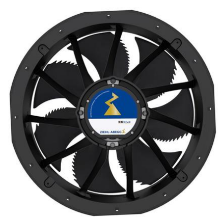
Fig. 3 Sickle shaped blade with a sawtooth-shaped edge

Since the speed and direction of the flow in the fan continuously change along the blades, different parts of the blades emit sound of different frequencies ensuring a wide band of continuous noise spectrum. However, the noise on the boundary layer of the blade may have discrete components. To combat this phenomenon, blades with a sawtooth-shaped output edge are used (Fig. 3) [5].