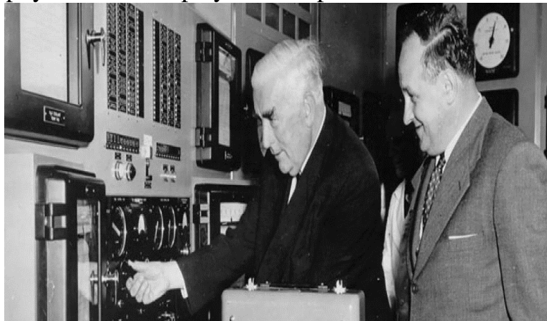
Figure 1.2 Moata research reactor- ANSTO

Moata was one of ANSTO's first reactors and operated successfully for 34 years until 1995. It was a small 100 kW research reactor and was initially used for research and training and later included activation analysis and neutron radiography. Moata also played an important role in aircraft safety [4].