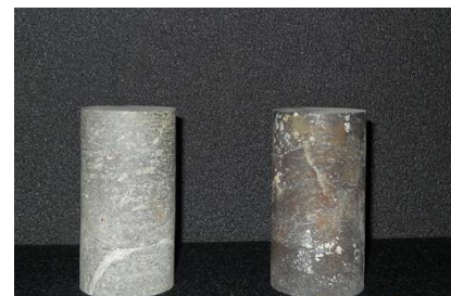
Figure 1. Samples image: left is skarn sample, right is ore sample.

The test objects are rock samples from Tashtagol ore mine (Kemerovo region). These are skarn samples with different petrographic composition without magnetite and magnetite ore samples with different content of magnetite. Cylindrically-shaped samples with a diameter of 42 \pm 1 mm and a height of 80 \pm 2 mm were cut out of the core. Before testing, the sides of the samples were polished until flatness with the discrepancy no more than 0.5 \pm 0.1 °. The angle between the sample sides and its axis was 90 \pm 1 °. The image of the samples is shown in Figure 1.