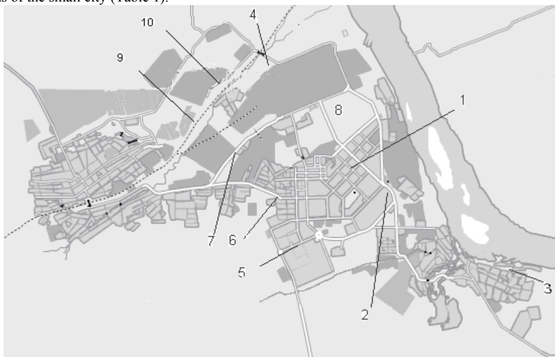
Figure 3. Map of small town with marked measurement points

Before the measurements were allocated on a map of the point at which it is necessary to carry out measurements (Fig. 3). Test points were chosen on the location of basic industries and residential areas of the small city (Table 1).