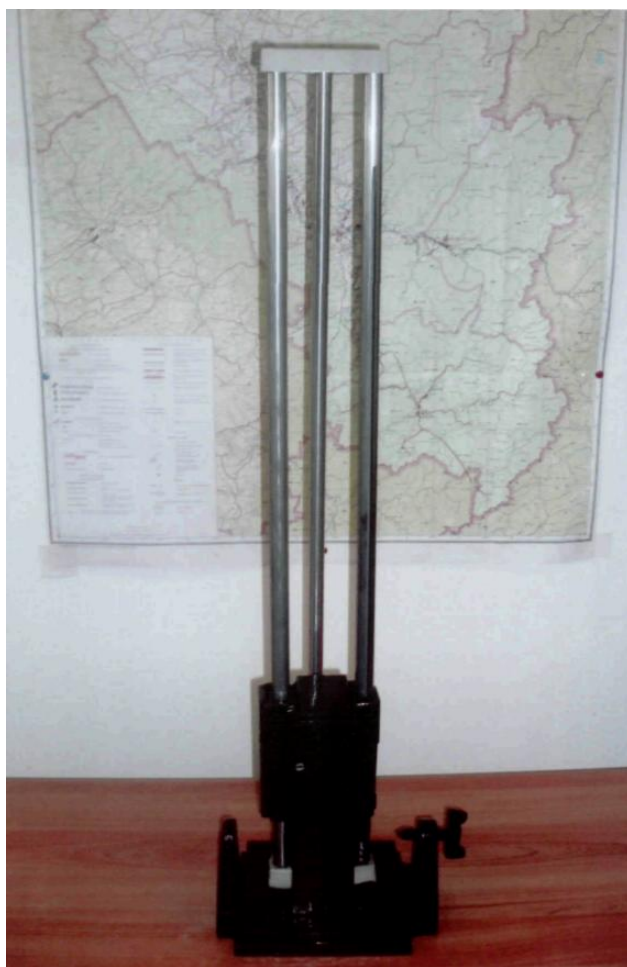
Figure 3. Drop-hammer for assessment of the degree of grinding various lithotypes overburden

These researches were carried out on a samples of overburden from the open-pit mine “Krasnobrodsky”. 200 samples of rocks (100 - sandstone, 100 - siltstone) were used. Fractional composition of broken rocks was determined by sieve method. Granulometric composition of sandstone is given in Table 4, of siltstone – in Table 5.