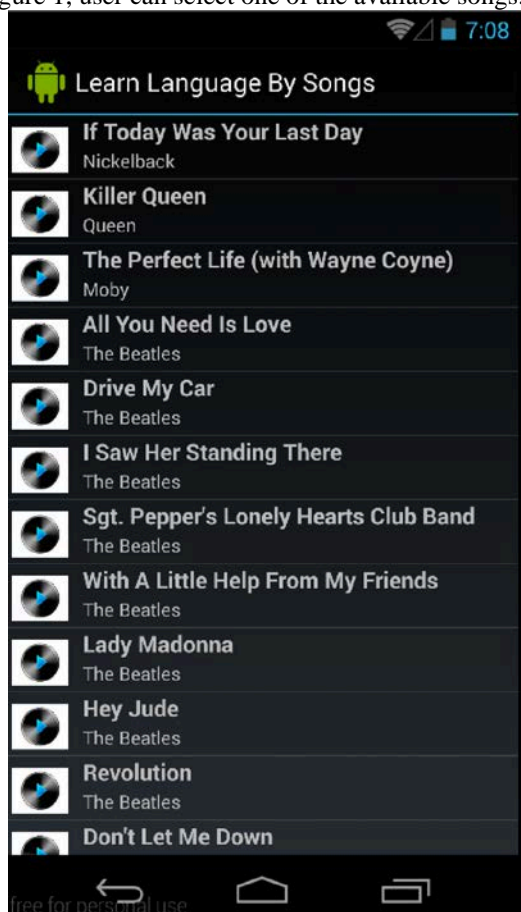
Fig. 1. Application launch window

In the launch window, which is represented in Figure 1, user can select one of the available songs.