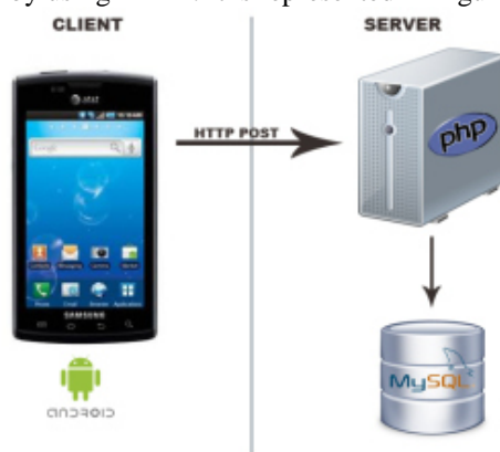
Fig. 4. Client-server model

The application is designed as client-server which interacts by using HTTP. It is represented in Figure 4.