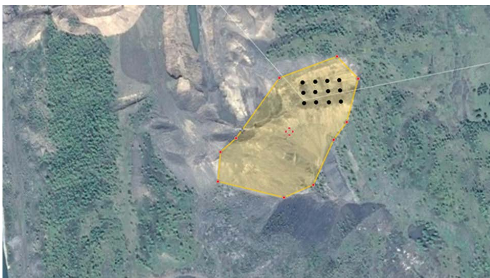
Figure 2. Sample points location on the surface of burning rock dump (Scale 1:2000) The results of measurements and calculations of specific flow of gases are given in Table 1. The following values were taken: the volume of the container – 0.018 m^3 , contacting area of

To determine the sampling points, a 10 m grid was placed over a total area of 600 m^2 (Fig.2). In the grid nodes mining holes were drilled having a depth of about 30 cm and a diameter of 30 mm. On the surface of the well containers were established to measure the specific flow of gases. 12 check points were selected on the surface of the rock dump with different rock temperatures. The first measurement was carried out in June at an ambient temperature of 25 ^\circ C . Repeated measurement was made in September at an ambient temperature of 15 ^\circ C .