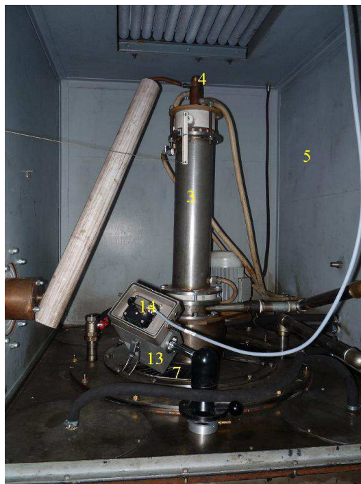
Fig.2 The photo of a laboratory plasma stand "Plasma module based on high-frequency generator VCHG8-60/13-01" with installed gas analyzer «Quintox» KM9106

coaxial output, 7 is impeller reactor, 8 is the node of "wet" cleaning exhaust gases, 9 is exhaust fan (PL 12-26, № 4), 10 is duct, 11 is analyzer «Quintox» CM 9106, 12 is sampler, 13 is protective cover pyrometer, 14 is pyrometer IPE 140/45, ICH - HF generator VCHG8-60/13-01