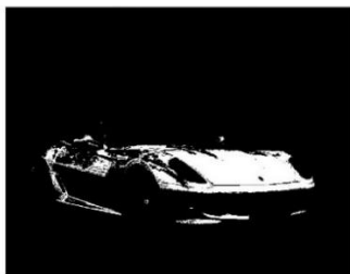
Fig.2. Segmented image