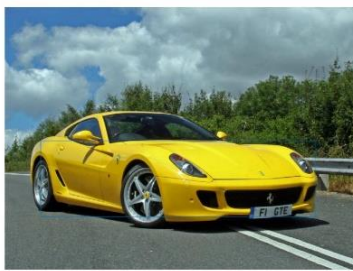
Fig. 4. Selecting the selected object

Figure 4 shows that after segmentation based on color analysis, the required object was detected.