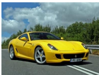
Fig.1. Original image

In this section the algorithm of color image segmentation, the results are presented in the following figures. Figure 1 shows the original image in JPEG format in the RGB color space.