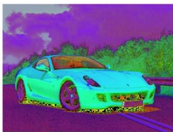
Fig. 5. Image in HSV color space

Let's look at the results of testing the algorithm based on color analysis in HSV space. Figure 5 shows that the color model was converted from RGB to HSV.