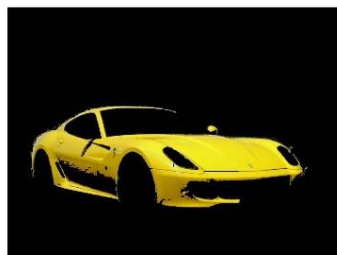
Fig. 8. Segmented image

Figure 8 shows that after segmentation based on tone analysis, the necessary object was found.