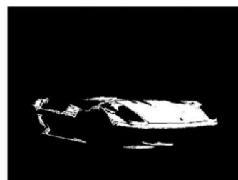
Fig. 3. After noise removal