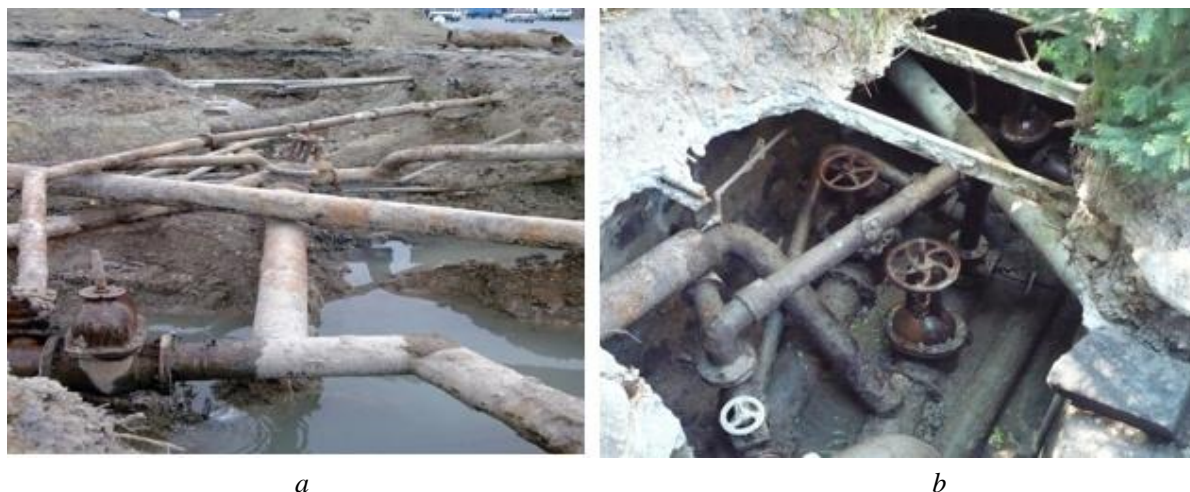
Fig. 3. Water supply network management units before reconstruction: a) network; b) chamber Рис. 3. Узел управления сетью водоснабжения до реконструкции: а) сеть; б) камера

A problem of pressure management in the water supply area is the decommissioning of local pumping stations. Because of the construction activities, 13 out of 22 pumping stations in the reconstruction zone were disabled. The remaining pumps were replaced with contemporary, reliable, high-efficiency pumps (Table 3).