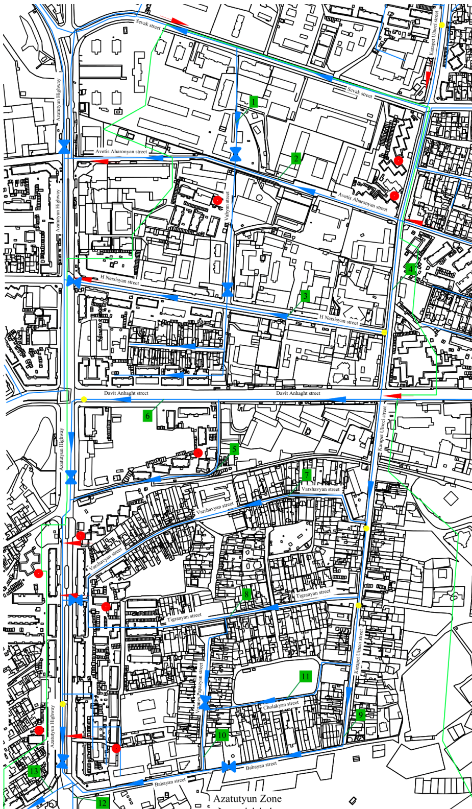
Fig. 2. Scheme of water supply zone in Inner Zeytun district: → – eliminated hydraulic connection; → – water flow direction; ● – pump station; ● – PRV; ▶▶ – closed valve; — – zone initial boundary; — – pipelines