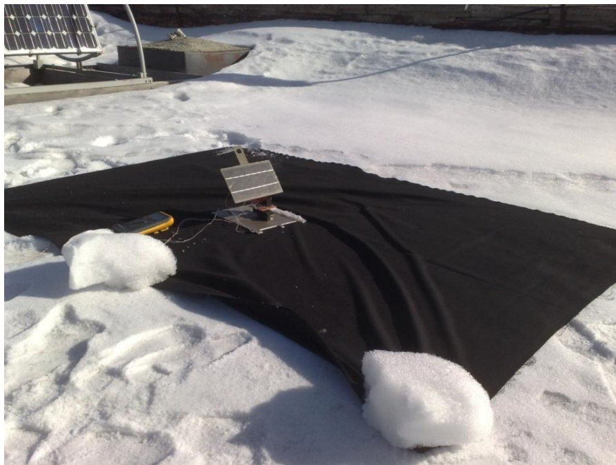
Figure 1. Experimental system for tracking the sun.

To determine the quality influence of the snow cover's reflectivity on the power value generated by the PV module, the special mechanical system of sun tracking IGS-1 was developed and used (figure 1). It allows to place on a special rod small-sized photovoltaic module as the sensing element. The measure element of the standard pyranometer M-80 used as standard model.