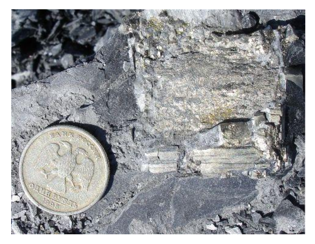
Figure 2. Inclusions of pyrite crystal in phyllite.

Legend: Aunakit suite (1-2): 1 – middle subformation: quartzitic sandstone interlayers; 2 – lower subformation: alternating carboniferous shale, quartzite and limestone sandstone and limestone; Imnyakh suite (3-4): 3 – upper subformation: white and / or creamy, slightly greenish limestone, limestone sandstone layers; 4 –lower formation: rhythmical alternating shale, limestone sandstone and limestone layers; Khomolkho suite (5-8): 5 – 5th horizon: phyllitic shale, carbon interlayers of aleurolites and quartzite-mica sandstones; 6 – 4th horizon: quartzite-mica aleurolites; 7 – 3rd horizon: rhythmical alternating carbon shale, aleurolites and quartzite-mica sandstones; 8 – 2nd horizon: high-carbon shale; 9- small ore-hosting faults; 10 – licenced area contour.