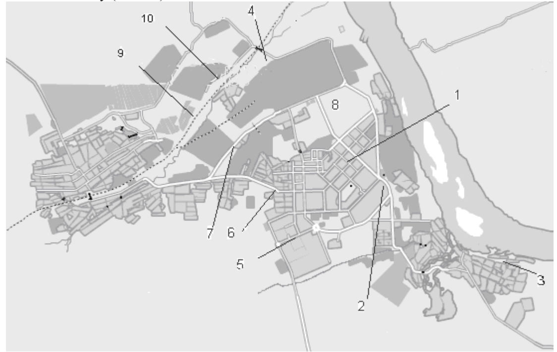
Figure 3. Map of small town with marked measurement points

Before the measurements were allocated on a map of the point at which it is necessary to carry out measurements (Fig. 3). Test points were chosen on the location of basic industries and residential areas of the small city (Table 1).