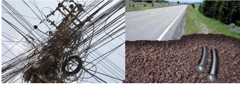
Figure 1 (left) – Before and after laying underground cables.

Underground cables are part of the electric transmission system designed for underground installation. Their main purpose is the transmission of electrical energy. Undergrounding refers to the replacement of overhead cables providing electrical power or telecommunications, with underground cables. This is typically performed for aesthetic purposes. In figure 1 below one can see how cables can improve the visual impact to people and surroundings.