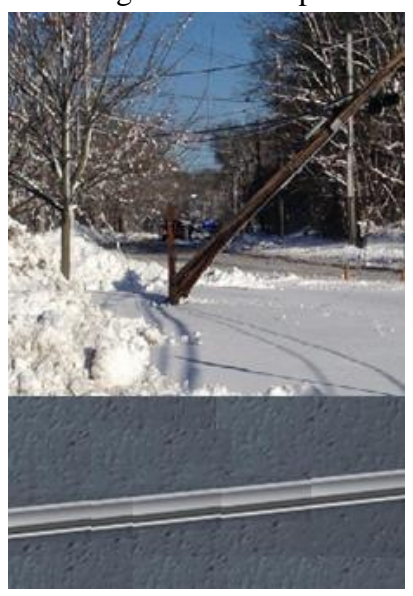
Figure 3 (left): Damage of overhead lines and reliability of underground cables from severe weather conditions.

• Much less subject to conductor theft, illegal connections, sabotage, and damage from armed conflict.