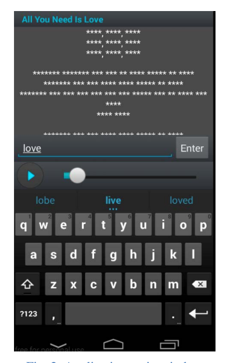
Fig. 2. Application main window

After that the main window (Figure 2) appears. It contains song title at the top, song lyrics in the middle of the window and playback control panel and input field at the bottom. All characters of the song text are replaced with asterisks (*). Then we can start to listen to the song and enter words.