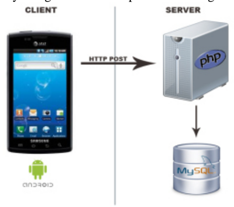
Fig. 4. Client-server model

The application is designed as client-server which interacts by using HTTP. It is represented in Figure 4.