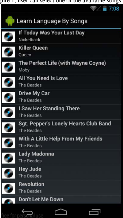
Fig. 1. Application launch window

In the launch window, which is represented in Figure 1, user can select one of the available songs.