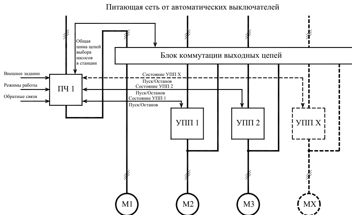
Fig. 3. Functional diagram of the control system of pump station with one frequency converter and smooth start devices: UPP 1, UPP 2, UPP X – thyristor devices of smooth start

Питающая сеть от автоматических выключателей – Supply main from the automatic cutout; Блок коммутации выходных цепей – Switching unit of the output circuits