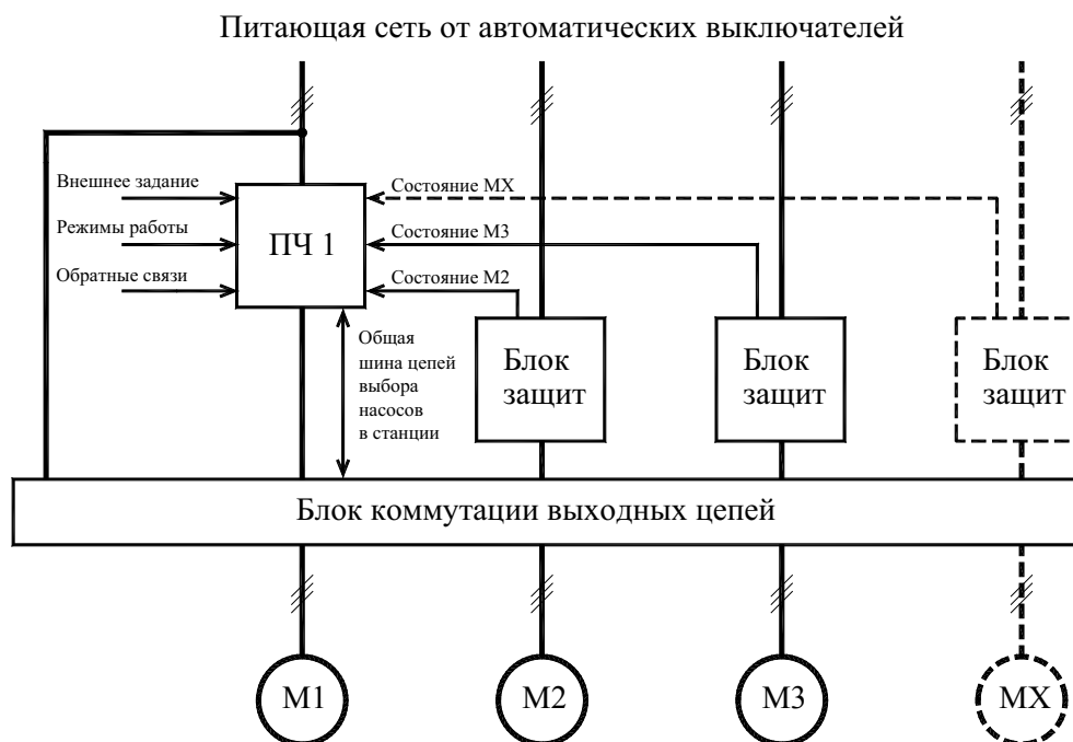
Fig. 2. Functional diagram of the control system of pump station with one frequency converter: M1, M2, M3, MX are the induction motors of the pumps in the station; ПЧ 1 is the frequency converter

The functional diagram of such pump station control system is introduced in Fig. 4. The efficiency form rotational velocity of all pumps may have additionally to 10...12 % from the total contribution into energy saving. The reason is in the absence of pressure loss in output