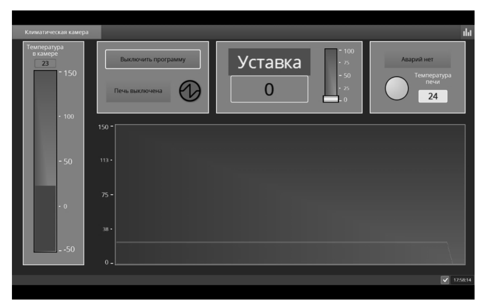
Figure 2. The SCADA system during operation

Developed SCADA system allows automation research in the field of diagnostics and reliability elements of automation systems [2, 3] and power electronics [4,5].