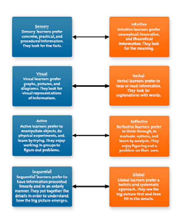
Fig.1. Learning styles

These styles are overlaid with a person's preference for learning is a social or solitary environment and how they absorb and process the information through reflection or other options to create a complex web of possibilities: