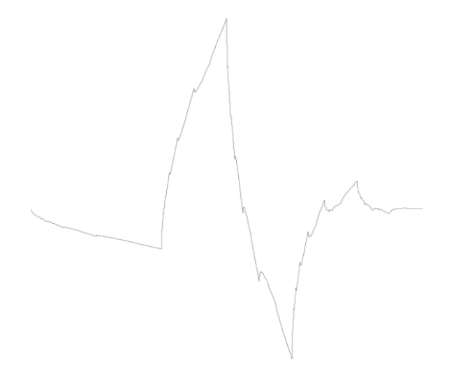
Figure 2. The types of wavelet function. 2D wavelet spectrum (fig. 3).

For wavelet analysis of input signal we use wavelet Daubechies that is in-line in Mothcad (fig. 2)