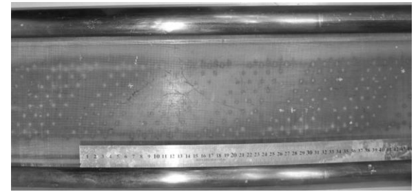
Figure 2. Ion beam autograph left on the emission grid on the side of the high-voltage acceleration gap in the experiment with no mask in the emitter.

when a diffusion pump is used, etc. The decrease in electric strength of the high-voltage acceleration gap is accompanied by the loss of one of the main advantages of electron sources with plasma emitters with grid stabilization of the plasma emission boundary, namely the independence of the beam parameters from each other, as in this case, the processes occurring in the acceleration gap affect the processes occurring in the discharge gap.