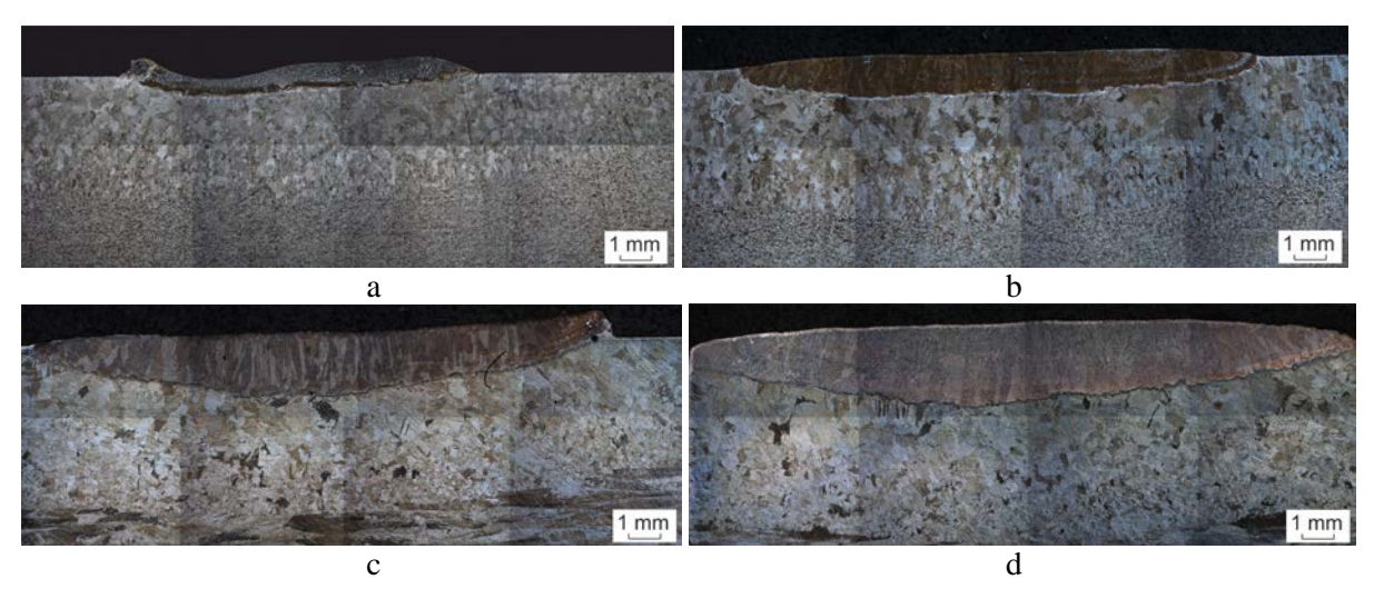
Figure 1. Micrographs of the layers obtained by means of non-vacuum electron-beam facing of Ti-Ta powder mixture using currents of 7 (a), 8 (b), 9 (c) and 10 mA (d).

IOP Conf. Series: Materials Science and Engineering 124 (2016) 012117 doi:10.1088/1757-899X/124/1/012117