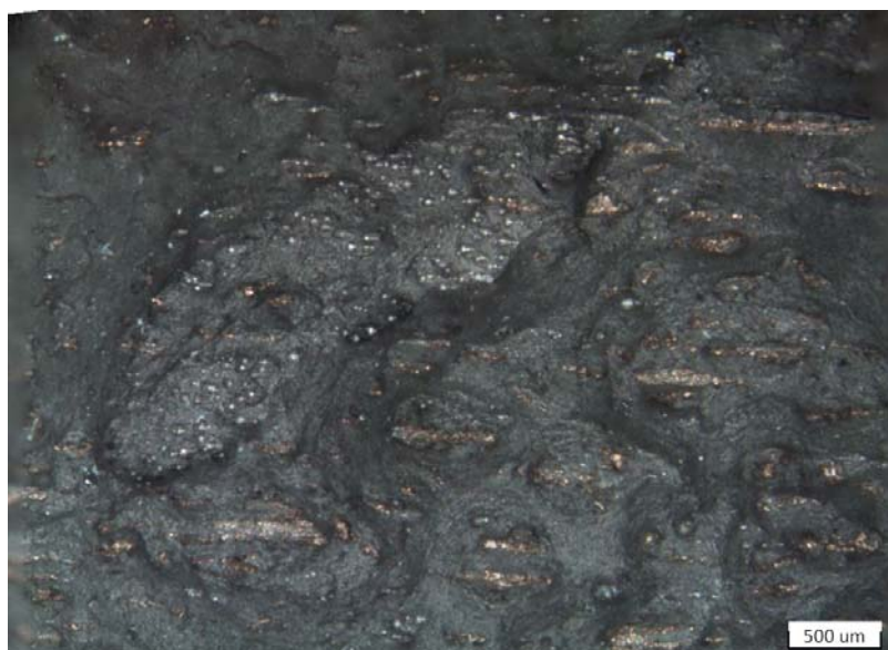
Figure 2. Kind of fracture of the sample with lowered plastic properties, selected products 2A82-1M

As can be seen from the photos, presented in Figure 2, on the samples taken from the work piece number R6986A1-1, inclusions were golden color, which suggests their nature nitride.