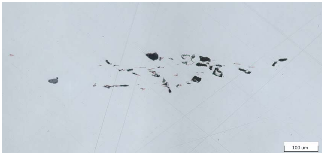
Figure 3. Specific inclusion in the metal sample, № R6986A1-1 view of the micro section

Photos inclusions micro sections and map the distribution of elements in the inclusions are shown in Figure 3 and Figure 4.