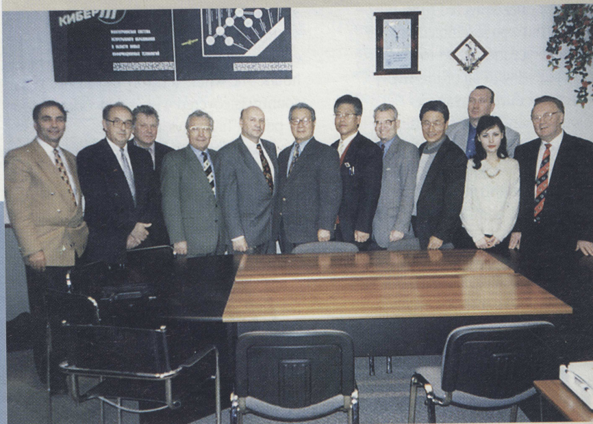
Photo: organizing committee of the KORUS'98 Russian-Korean Conference, Tomsk, 1998

На фото: оргкомитет Российско-Корейской конференции KORUS'98, Томск, 1998