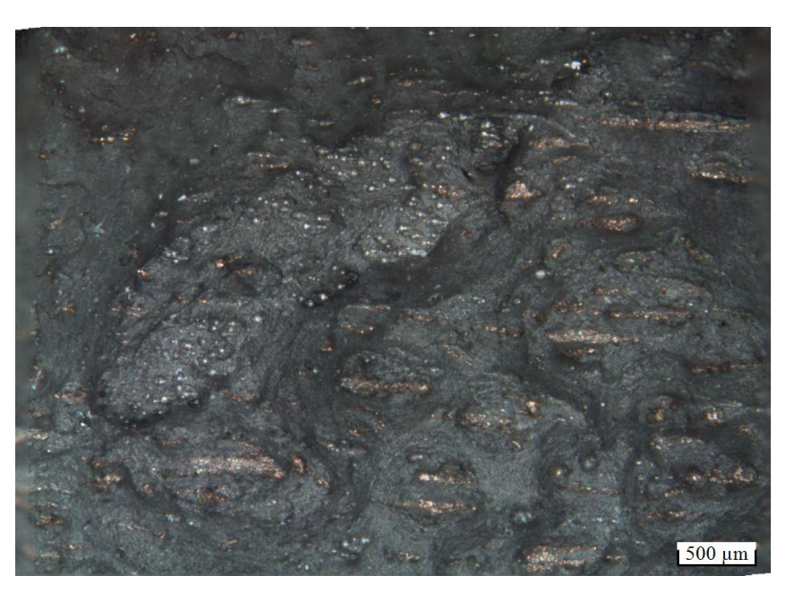
Figure 2. Type of fracture of the sample with lower plastic properties

Detailed study of nonmetallic inclusions in the fracture detected samples for mechanical tests were conducted on selected samples in which unsatisfactory results in terms of metal plastic properties were obtained. As a result of research, it was found that the reason for the decline of properties blanks is large concentrations of nonmetallic inclusions onto the surface of the fracture. Type sample fracture is shown in Figure 2.