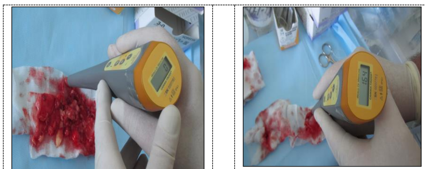
Figure 3. Direct radiometry macropreparations.