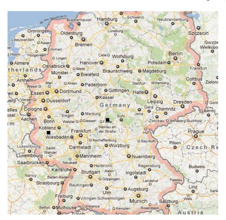
Fig. 1. The scheme of the location of the studied bogs (■)

Two bogs located in the central part of Germany were used for the peat sampling and further investigations: Strohner Maarchen, Eifel region and Rotes Moor, Hassian Rhoen (Fig. 1). The first bog is located in agricultural and touristic region near the bottom of former volcano Eifel, the second one – in mountain region (Rhön Mountains).