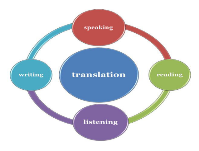
Fig. 3. PhD language training model.

There is an open-ended question, then, as to what exactly to include into the course or a single module devoted to technical translation, proceeding from the number of hours allocated to the English language within a PhD program, and each university takes the final decision on the individual basis. It all depends on students' initial level of language and their real needs to learn it. There is no doubt, whatsoever, that a specialized translation course along with relevant translation practices are no longer a luxury, but the necessity arisen from technical students' priorities. What is more, subject to current language tasks, translation should no longer be regarded a mere second-class tool for grammar and vocabulary acquisition (Belcher, 2006) but as the main component amounted to PhD language proficiency. This idea can be depicted by Fig. 3.