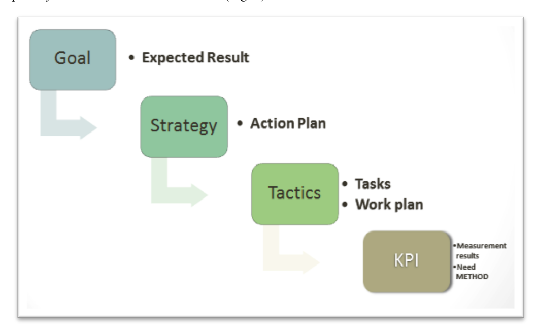
Fig. 1. KPI place in business process system

KPI's are a good alternative, reforming the business management system as a whole. KPI binding to the target wage level allows employees to express goals of the owner in a simple and understandable way - in salary (Srimannarayana, 2010). Enterprise Management System involves a chain of "goal-strategy-tactics-business processes." Levels can be both formal (typical for a company with a high level of internal organization), and formalized (Gabcanova, 2012). First, let us define the purpose of the enterprise. For example, the goal is to retain current position in the market. Then depending on the goals, the main directions of the goal (its strategy) are being outlined. According to the planned direction, a work plan is being developed - a tactical level of management. Further, at the operational level, the work plan is adopted by members of stuff to their work (Fig. 1).