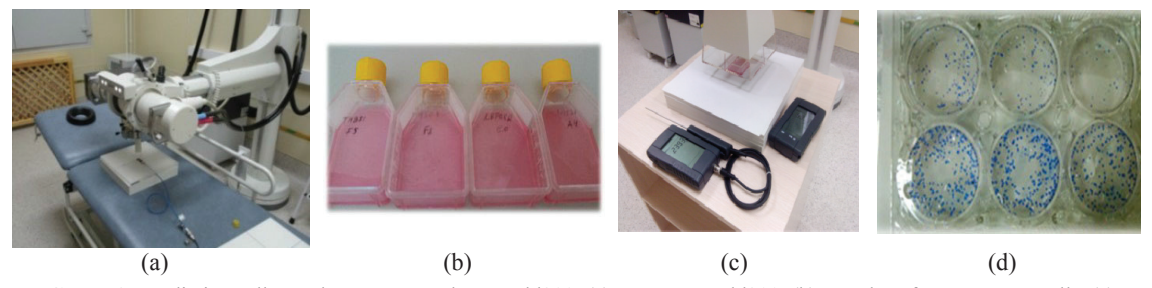
FIGURE 2. Irradiating cell samples on X-ray tube Xsrtahl300: (a) system Xstrahl300, (b) samples of cancer HeLa cells, (c) geometry of cells irradiation, (d) samples of cancer cells 2 weeks after irradiation

Based on the obtained data, the analysis of the comparison of the clonogenic survival of the cancer cells between the samples containing cisplatin (Cis3) and in the absence of the drug (Cis0) was carried out. Figure 3 show that the presence of cisplatin has a significant effect on the survival of the cancer cells.