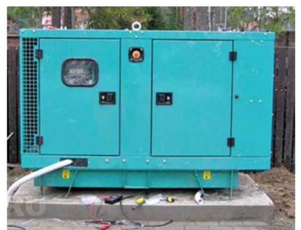
Figure 2. Vibration damping.

Vibration damping: is to increase the mass of the system and it is carried out by installing aggregates on a massive foundation [22, 23]. This method is effectively used when reducing the vibration of block equipment. In Figure 2 shows the vibration damping of a gas piston power plant.