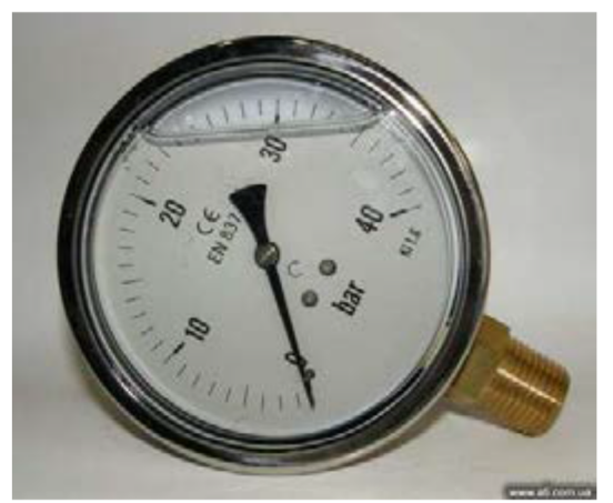
Figure 3. Glycerin filled manometer.