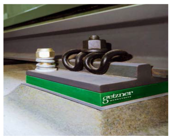
Figure 1. Vibration isolation Getzner.

Vibration isolation: Reduction of vibration consists in reducing the transfer of vibrations from the oscillating device to the manometer, with the help of elastic pads, springs placed between them, etc. An example of vibroinsulation with Getzner gaskets is shown in Figure 1