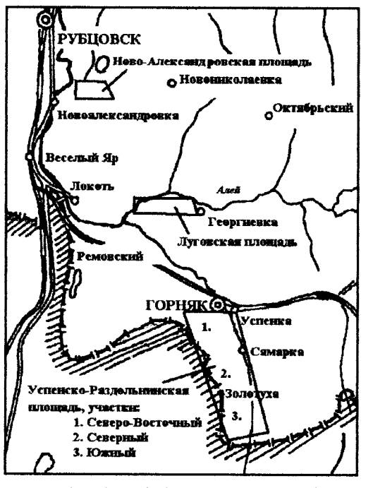
Fig. 1. The plan of the prospecting areaslocation. Scale 1:1000000

As a result of coal deposit studying the collection of mineral material (4500 samples) from deposits of three areas was selected: Novo-Aleksandrovskaya, Lugovskaya, Uspensko-Razdolninskaya (Fig. 1). On the basis of paleontologic and lithologic material, taking into account the data of Open Society «Rudno-Altaiskaya Expeditsiya» geologists (Zmeinogorsk), the author made composite sections of each area (Fig. 2).