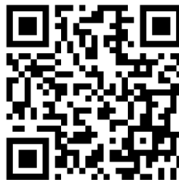
Fig. 2. The app's AR token in the form of a QR code

To demonstrate work of the application, we created a label as a QR code for one of the batches (Fig. 2).