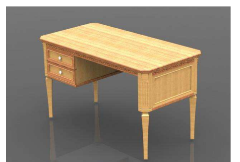
Pic. 4. The model of desk in SolidWorks FotoView

• machinery and Components: thanks to Assembly software it becomes possible not only to design a part, but also to gather parts into a mechanism and then to trace its operation (assembling objects in SolidWorks is much simpler and better information is presented so that mates can easily be changed should a revision be necessary, whereas Autodesk Inventor requires you to specify direction of mates by entering negative or positive values and then hoping the completed mate won't wreck the model).