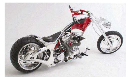
Pic. 2. A motorcycle model, created with SolidWorks

chines can be designed with the CAD system. Solid-Works opens endless possibilities for engineers and designers to create and configure the elements of details and their compounds. SolidWorks makes it possible not only to design the item but also to prepare it for industrial manufacturing.